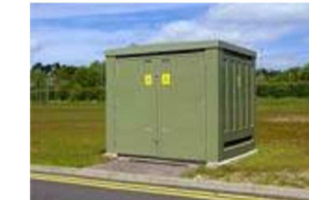
3M x 2.45M GRP ENCLOSURE

Colour: BS 5252, Colour Reference 12 B 23, Description: Green